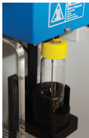
— Soil Station

Samples run in the soil position can be heated and stirred while being purged